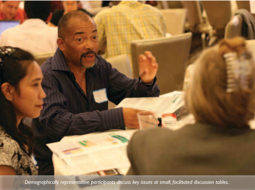
Demographically representative participants discuss key issues at small, facilitated discussion tables.

ample, the Region of Opportunity Action Group partnered with the city and county government to prepare a master plan for the downtown, with unprecedented levels of public participation. The Healthy and Caring Community Action Group is expanding proven techniques to reduce substance abuse and coordinated a two month volunteer program to help low income families sign up for low cost health insurance.