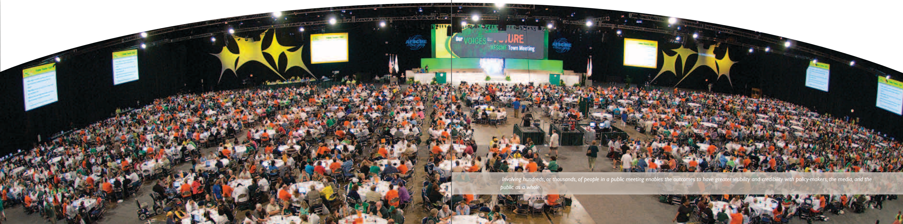
Involving hundreds, or thousands, of people in a public meeting enables the outcomes to have greater visibility and credibility with policy-makers, the media, and the public as a whole.

Successes in both large and small scale public participation projects, achieved over the past few decades,