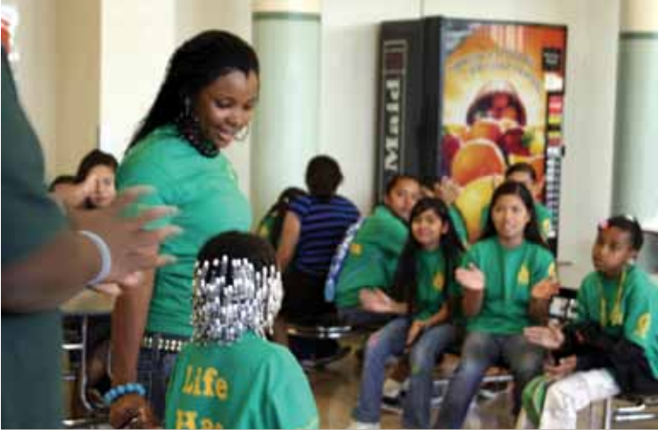
Students put on a show after school at one of Multnomah County's SUN Community Schools.

T here are a growing number of communities that are moving this school and community agenda forward. Cincinnati's Board of Education established a policy that all schools built under a major school reconstruction program will be Community Learning Centers. Each school has a different physical and program design that reflects the needs and aspirations of neighborhood residents. The intensive community engagement process that led to these school plans distinguishes Cincinnati's initiative. Networks of community partners focused on extended learning, physical health, mental health, college access and parental engagement, and the partners provide these services at the schools. A full-time resource coordinator, employed by an external partner (i.e., YMCA) integrates