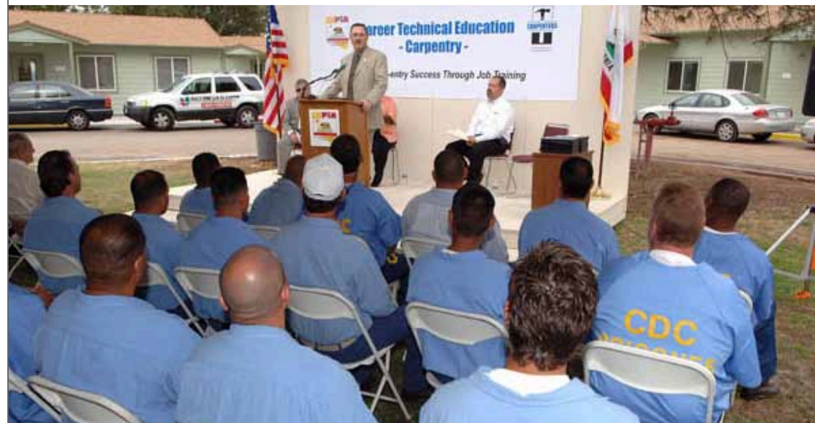
Inmates attend a job-training presentation to help them prepare for a more successful transition into the job market upon release.

Reducing the need for more prisons in Kansas: In 2007, Kansas approved criminal justice legislation with the potential to significantly reduce the projected need for additional prison beds. This legislation included the creation of a performance-based grant program for community corrections to reduce parole revocations by 20 percent and restore earned good-time credits for good behavior for individuals incarcerated for nonviolent offenses, so that more people will be released on parole. This change in the parole system is projected to save $80 million over the next five years in reduced capital and operating expenses, about $7 million of which will be reinvested in community corrections and substance abuse and vocational training programs.