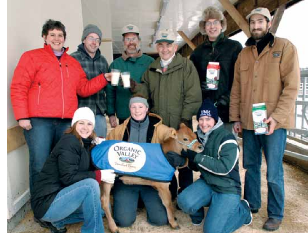
Organic Valley was started in Wisconsin in the 1980s and is now owned by over a thousand farmers in 32 states.

One of the tenets of democracy is the common good—the greatest possible good for the greatest possible number of individuals. Businesses that close the gap between owners and workers are growing fast. Cooperatives are democratic businesses in which the owners are also the business’s workers or users of its services. In all their varieties—from finance to housing, farming, manufacturing and more—equitable sharing of responsibilities and benefits is a key value. Co-op membership has more than doubled in the last 30 years, now