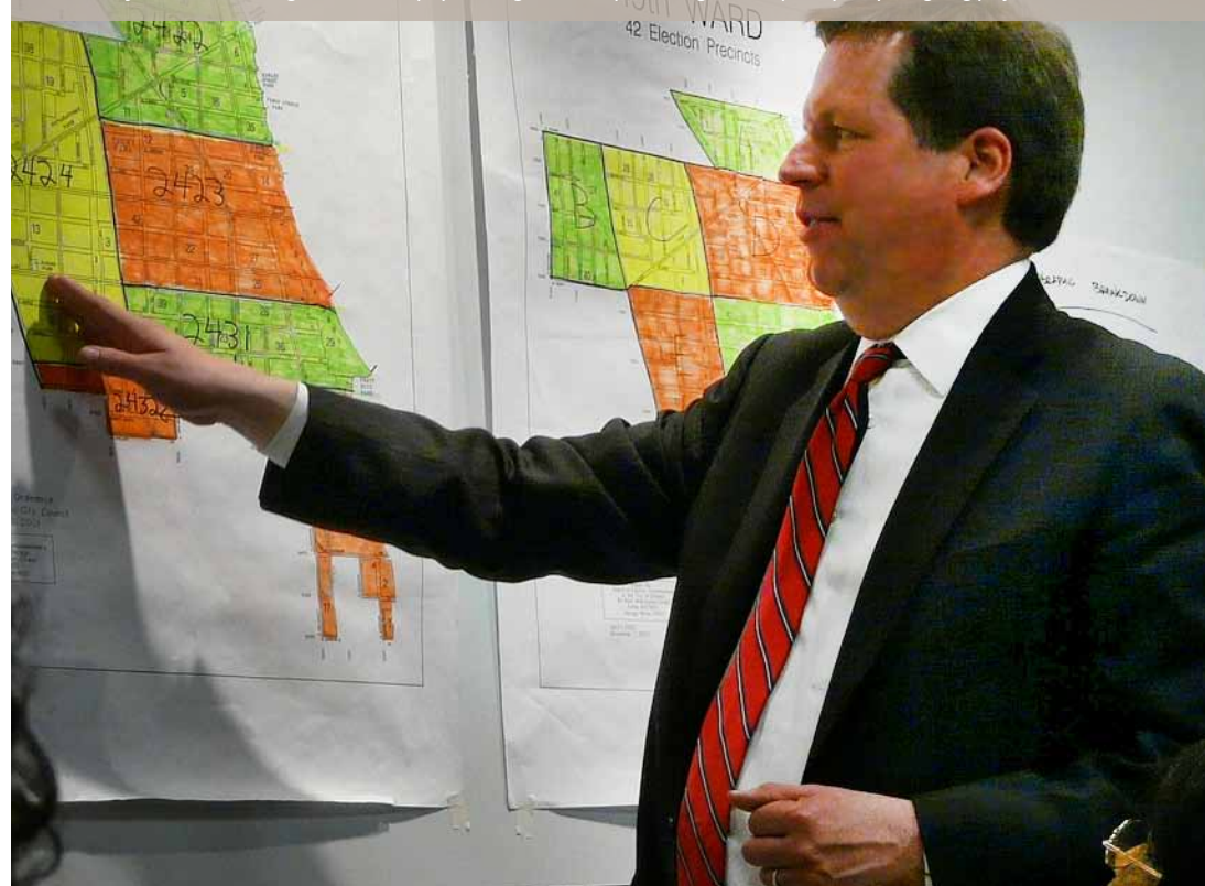
Alderman Joe Moore of Chicago’s 49th Ward played a large role in implementing the first participatory budgeting project in the U.S.

be funded with the ward’s $1.3 million capital infrastructure discretionary budget. A study of Brazil found that with more citizens’ eyes on the budgeting process, there is less graft, greater government transparency, more equitable public spending along with increased public participation.