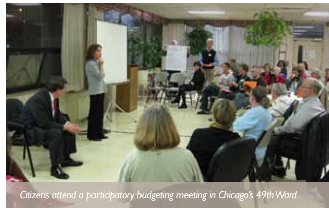
Citizens attend a participatory budgeting meeting in Chicago’s 49th Ward.

budgets. One way to engage citizens is through participatory budgeting where citizens have a direct say in the local budget. This process of democratic decision-making has been in place in many Brazilian cities since 1989. Ten years later, Chicago’s 49th Ward launched the first participatory budgeting project in the U.S. In a series of public meetings over a six-month period, community members decided which community projects would