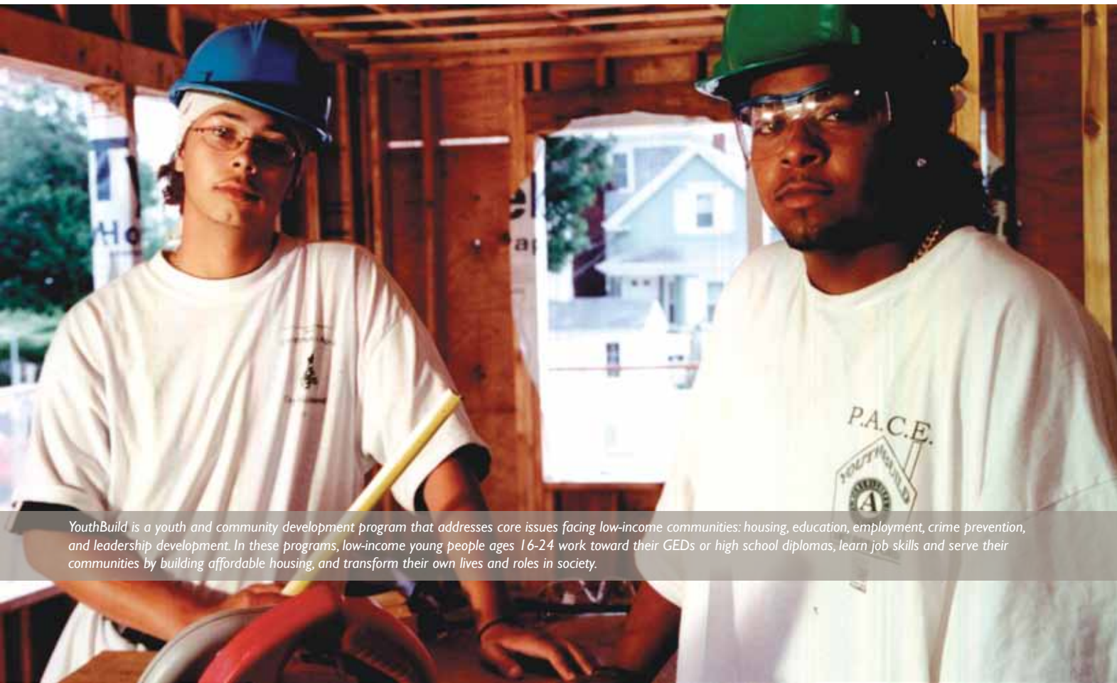
YouthBuild is a youth and community development program that addresses core issues facing low-income communities: housing, education, employment, crime prevention, and leadership development. In these programs, low-income young people ages 16-24 work toward their GEDs or high school diplomas, learn job skills and serve their communities by building affordable housing, and transform their own lives and roles in society.