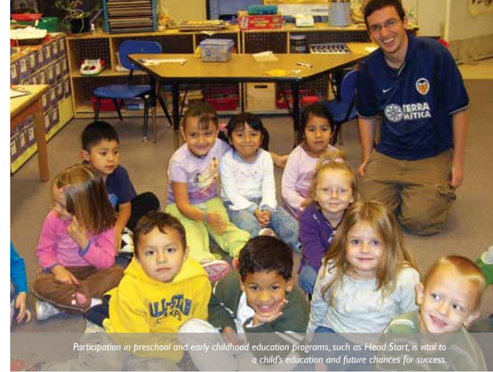
Participation in preschool and early childhood education programs, such as Head Start, is vital to a child's education and future chances for success.

President Obama agrees that continued effort should be placed into improving K-12 education through measures designed to expand learning time, promote high expectations and accountability and improve teacher quality. The Obama Administration's Early Learning Challenge Grant proposal challenges states to develop effective, in-